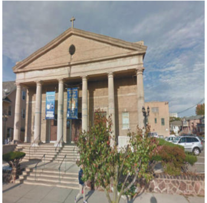
Saint Michael Church