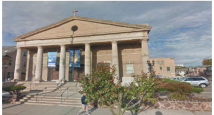
Saint Michael Church

Contact 312 First St. Palisades Park, NJ- 201 944-1061